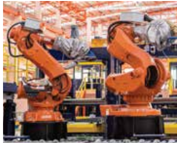
General Manufacturing & Industry