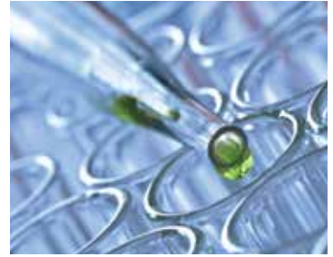
Biotech, Life Sciences, Agri Science